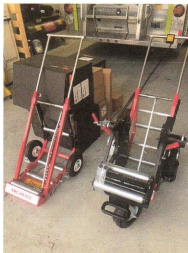
New RollINRack to roll 5" Hose