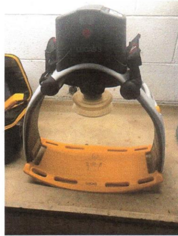
New Lucas Device