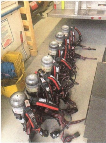
6 New Air Packs