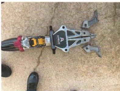
Battery Operated Amkus Spreaders