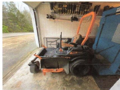
New Lawn Mower