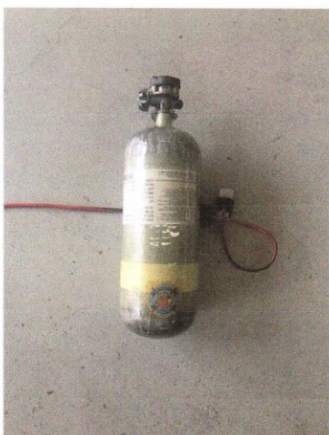
18- New Air Cylinders

We also received 9 – New Mattresses, 2 – Hydrant Diffusers, 2 – Elevator Key Kits, Also received some of our high angle rescue equipment.