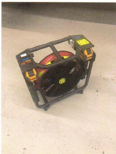
New Battery Operated Fan