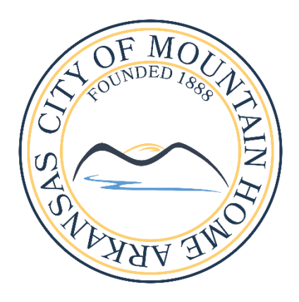
AGENDA MEETING OF THE MOUNTAIN HOME CITY COUNCIL JUNE 1st, 2023 @ 6 P.M. COUNCIL CHAMBERS OF THE MUNICIPAL BUILDING

Pledge of Allegiance Prayer Roll call Minutes from May 18th Council meeting Committee reports Bank reconciliations Announcements